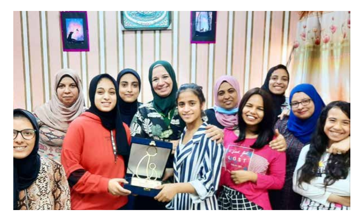
Category of quality of Institution Management – Second place: Dar Al Rahma for Girls – Ismailia