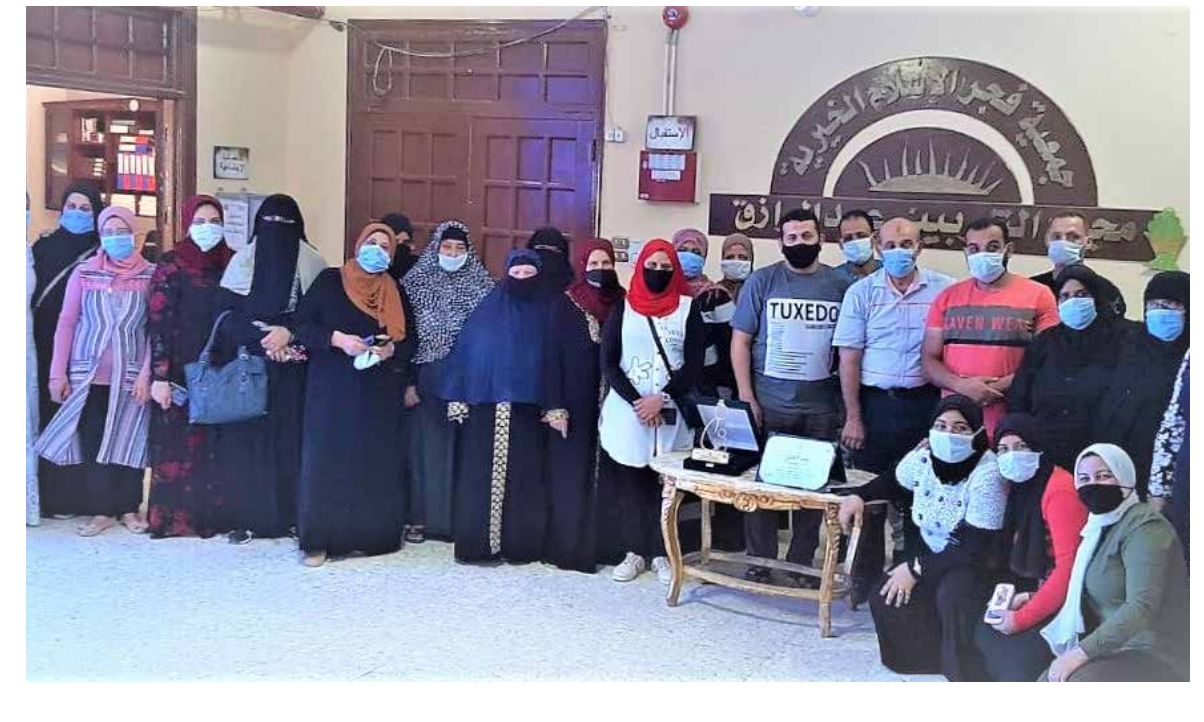
Category of quality of Institution Management – Third place: Dar Fagr Al Islam – Dakahlia