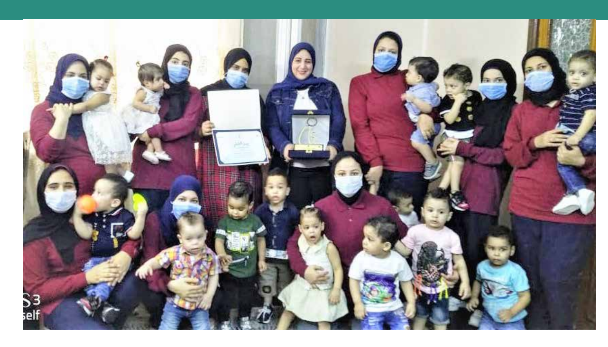
Category of quality of institution management First place: Dar Al Orman – Alexandria