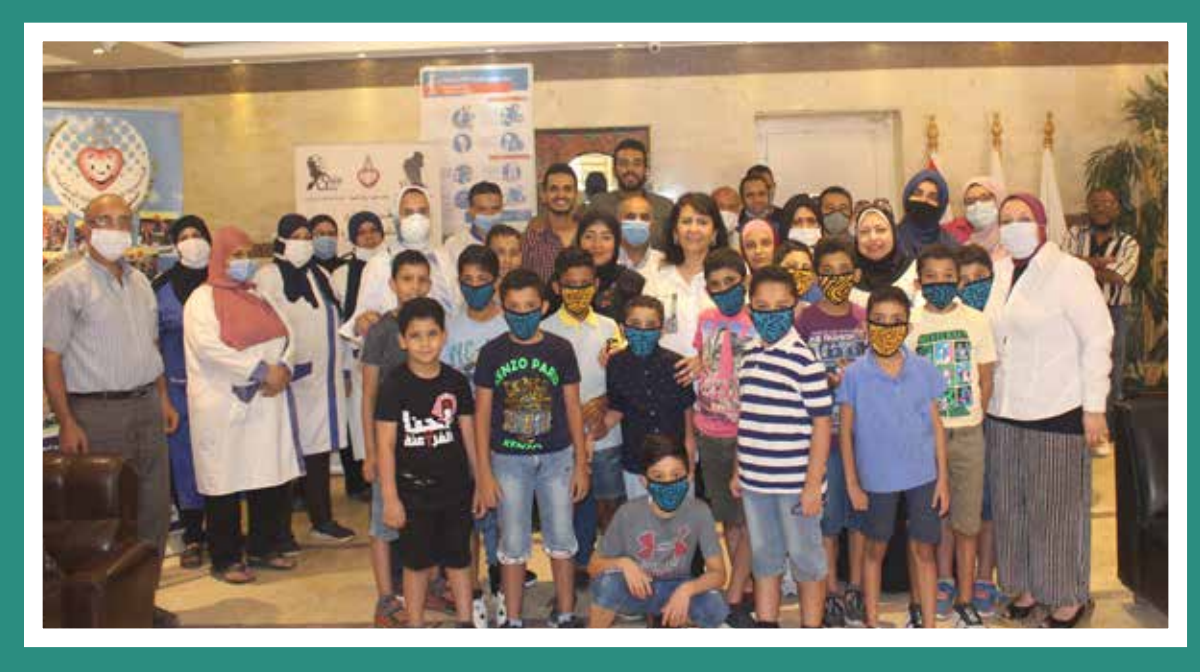
Category of quality of child protection Dar Al Fustat – Giza